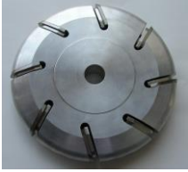
30W Top rounded Cutter Body Part Code H30WB Dimension 30Wx \phi 160