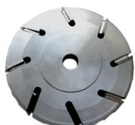
20W Top rounded Cutter Body Part Code H20WB Dimension 20Wx \phi 218