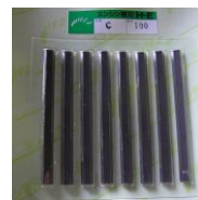
100W Flat Type Cutter Blade Part Code HE100WN Dimension 100Lx8Wx5t