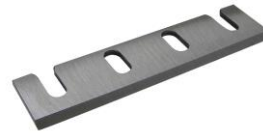
120W Flat Type Cutter Blade Part Code H120WN Dimension 120Lx25Wx5t