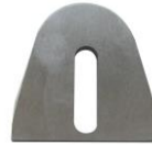
30W Top rounded Cutter Blade Part Code H30WN Dimension 30Wx35Lx5t