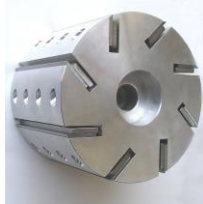
120W Flat Type Cutter Body Part Code H120WB Dimension 120Wx \phi 160