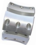
200R R-Type Cutter Body Part Code HR200WB Dimension 97Wx \phi 160x160R