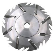
16W Top rounded Cutter Body Part Code H16WB Dimension 16Wx \phi 218