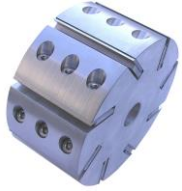
82W Flat Type Cutter Body Part Code H82WB Dimension 82Wx \phi 160